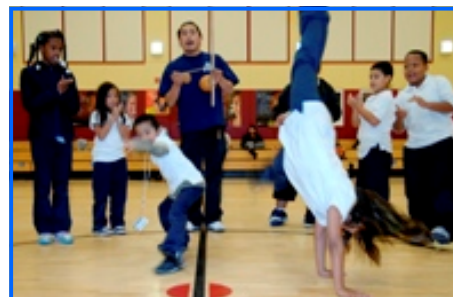
Capoeira- combines art, music, and dance