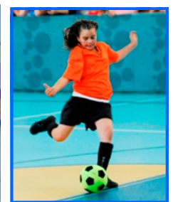
Indoor Soccer around the corner