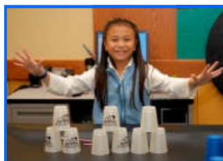
Cupstacking is always fun

Over 400 youth are attending both the DeLue & San Mateo Clubs daily. Here are a few highlights: