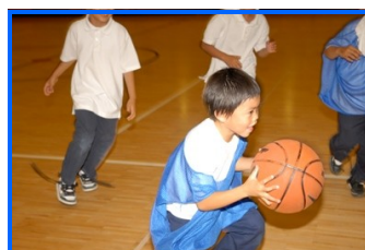
Basketball Leagues have begun with Daly City Park & Rec