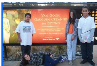
Members visited the DeYoung Museum & Van Gogh Exhibit

Over 400 youth attend both our DeLue & San Mateo Clubhouses daily. Here are a few highlights: