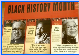
February is Black History Month at the Club