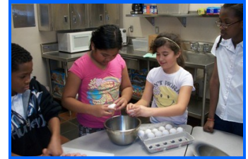
Healthy Habits Weekly Cooking Class is part of our Nutrition & Physical Fitness Program

room, Triple Play generates a beehive of activity through intra-club competition. Neo-Sci uses hands-on experiments to teach our kids about chemistry and biology while encouraging them to think about a career in science. Our leadership and service clubs, Torch Club and Keystone Club , have a full calendar of projects planned for this winter and spring. Wow!