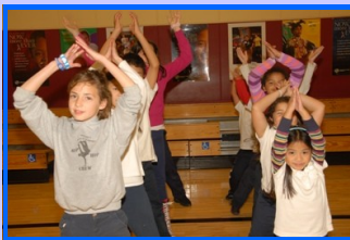
Members take part in breaking the Jumping Jacks World Record on March 22nd