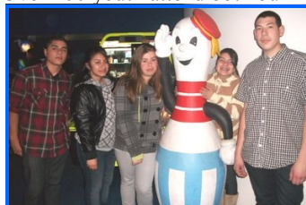
Keystone Club Organizes a Teen Night at the Bowling Alley

Over 400 youth attend both our DeLue & San Mateo Clubhouses daily. Here are a few highlights: