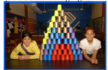
Artistic Cupstacking Challenge