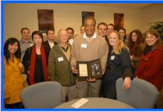
Rotary & Rotaract at our March 16th "Be A Kid For A Night!"