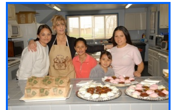
"Kids Helping Japan Bake Sale" Leaders

ceeds have gone to the American Red Cross to help with relief efforts in Japan. Special thanks goes to the Doubletree Hotel SFO for their generous donation of gourmet cookies. Thanks also to our kids, parents and staff for making this event possible. What a success!