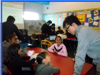
Hitachi America volunteers teach Universal Design Class