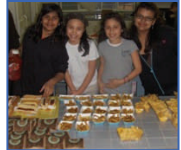
Club Members sell cookies to help Haiti relief effort

members and staff, our kids raised over $600. All proceeds have been sent to the American Red Cross which, among other organizations, is providing emergency medical care, food water and shelter. Thank you Doubletree Hotel San Francisco Airport, our Club parents, volunteers, and especially our kids for helping those in need.